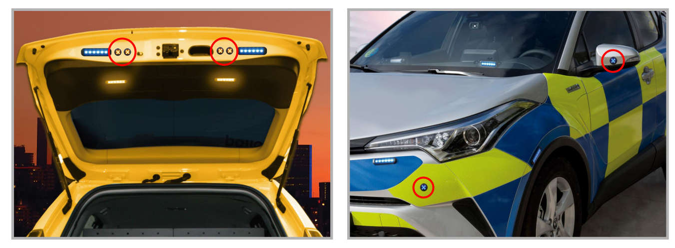
NanoLED Round installed with the NanoLED lights

The product range includes cruise light models, to adapt to the needs of any market and incorporates flush-mount or surface-mount models to adapt the installation in different positions of the vehicle.