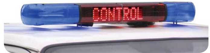
Phoenix lightbar with Smartsign integrated option